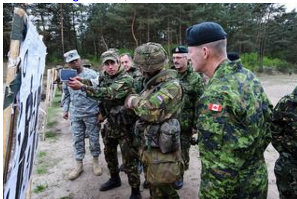
(live-fire training demonstration during the 4th Annual Conference of European Armies for Noncommissioned Officers)