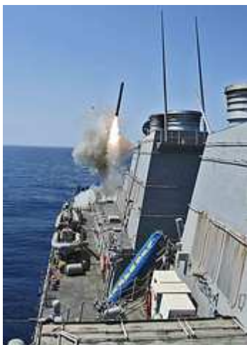
(USS Barry launches Tomahawk Against Libya, Mediterranean Sea, 29 March)

Viewpoint: 'Overwhelming' moral case for military path , BBC News , 8 March - As calls for a UN-imposed no-fly zone over Libya gather support, Australian former Foreign Minister Gareth Evans - who has championed the doctrine that the international community has a responsibility to protect civilians - explains the moral case for such a move