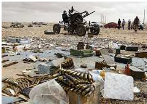
(A rebel mans an anti-aircraft gun in Ras Lanuf, 8 March)

What started out as an action that observed the majority of the norms of international law and multilateral consultation is now in danger of reverting to type. The heavy-handed application of unilateral US, French and British muscle and talk of regime change, arming the rebels and even assassinating Gaddafi risks breaking the fragile international consensus and many of the political gains secured through UNSC resolution 1973 – including the historic embrace of the responsibility to protect (R2P) principles agreed in 2005.