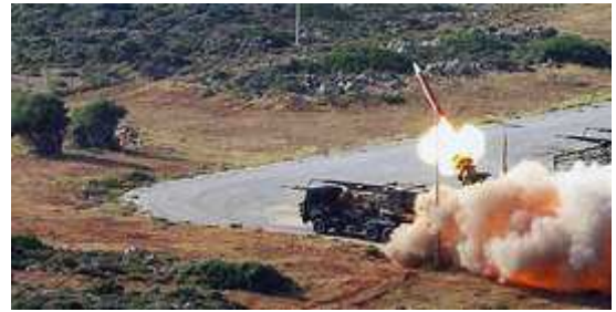
(Patriot missile firing from NATO base on Crete)

U.S. Awards $230M Missile Target Contract , Global Security Newswire , 11 March