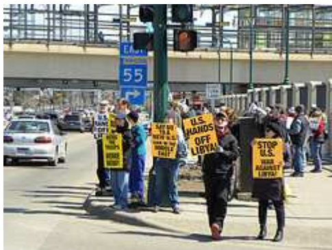
(Protest against US military actions in Libya, Minneapolis, Minnesota, 2 April –)