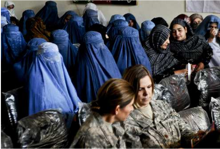
(Women's Day - Women from the Kunar Provincial Reconstruction Team and Iowa National Guard's 734th Agribusiness Development Team gather alongside Afghan women to celebrate International Women's Day at the Ministry of Culture and Information, 8 March)