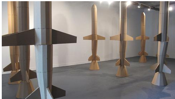
(Guns or butter – photo credit: Andrew Scott/ flickr)

In taking this work forward, Allies agreed that priority should be given to developing a Building Integrity contribution to support the Afghan National Security Forces. This is in addition to ongoing efforts to develop a tailored programme to support nations in South Eastern Europe. In other words, this is largely an outreach programme to build integrity among external partners rather than among Allies.