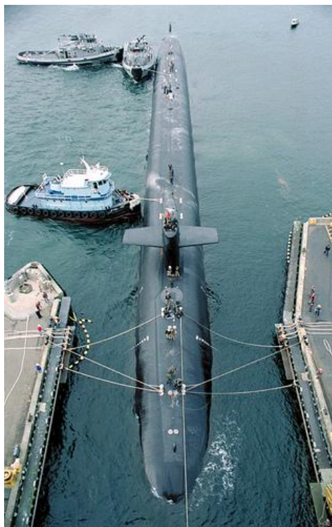
(The US Navy's Trident nuclear powered submarine USS Alaska (SSBN 732) is guided into an explosives handling wharf at the US Submarine Base, Bangor, USA. If Scotland votes for independence in 2014 might this be the future home of the British nuclear weapon fleet?)

Given the effect of defence cuts on the British Armed Forces' ability to conduct existing operations let alone new ones, together with another defence procurement black hole of around £4 billion on the horizon, Britain's top general might have also taken the opportunity in such a wide-ranging speech to comment on Britain's most powerful and expensive non-weapon. But no: as ever Trident remained out of bounds. Tony Blair reportedly signed up for Trident replacement, not because he was convinced as to the effectiveness of the nuclear deterrent but due to political expediency and institutional momentum. Cameron, the chief of defence staff and the wider UK defence establishment appear set to continue with Westminster's longest running farce.