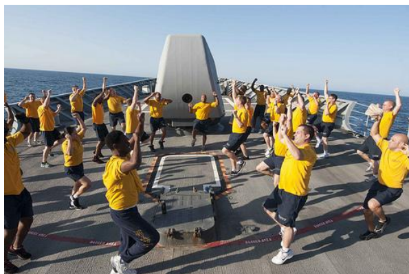
(US sailors exercise gangnam style on the deck of a ship at sea)

♦♦ It Is High Time for Congress to Focus on the 'O' in NATO , Sarwar Kashmeri, Huffington Post , 6 December