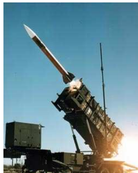
(US patriot missile)

However, the US has already spent over $100 billion dollars since the mid-1980s with only a limited working infrastructure to show for it. And according to insiders the ALTBMD system is three years behind schedule and barely a working prototype, while two independent US experts claim that the interceptors proposed for the Phased Adaptive Approach do not reliably and consistently hit incoming warheads. Is it really rocket science to expect parliaments throughout NATO to investigate the true capabilities of ballistic missile defence systems in advance of their procurement? But as history has shown, big military (and pharmaceutical) programmes are rarely cancelled once governments and the contractors are on board.